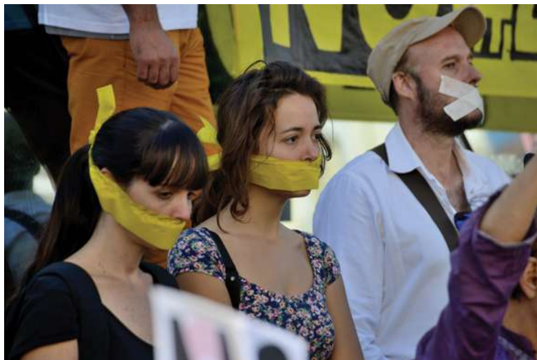
Madrid, Spain—November 1st, 2014, Gag laws.

Enough! For a new legislation that guarantees human rights', issued by Amnesty International Spain and backed by over 260 organizations (Amnesty International 2020). As noted by the Commission's 2021 report (2021: 18), in response to civil society pressure, the Constitutional court reviewed some of the contested articles of Organic Law 4/2015 in 2020 (such as the sanction provided by Article 36.23 of the Law which prohibited "the unauthorized use of images or data of authorities or members of the Security Forces of the State" (BOE 2020) which was in breach of article 20.2 of the Spanish Constitution (freedom of expression and information). However, according to the latest available annual statistics (Anuario Estadístico 2019), the articles most used to sanction citizens under this Law were not among those reviewed by the Constitutional court. 35