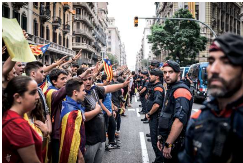
Barcelona, Spain—October 3rd, 2017, Aftermath of the Catalanian independence referendum