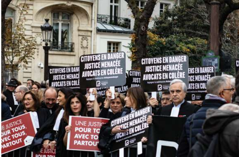
Paris, France—11.15.2018, Protest against the Loi de Programmation.