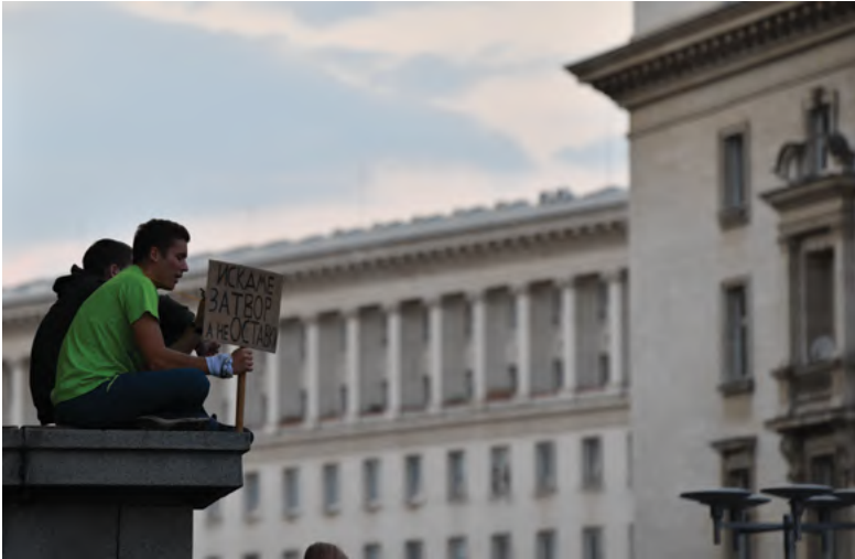
Sofia, Bulgaria—Sept 22 2021 Sofia central area.

Below, we survey some of the omissions and misrepresentations in the Reports' chapters on Bulgaria. Much of the content from the input submitted by anonymous and public stakeholders in the course of the consultation for the first 2020 Report has been ignored by the Commission—we have chosen to stay very close to these primary contributions, due to their value as material which the Commission has decided to leave out upon considered judgment. The European Parliament adopted a Resolution on the Rule of law and Fundamental Rights in Bulgaria on 8 October 2020, several days after the Commission's first Report was published, in which it condemned the systemic violations of the rule of law in the country. We also reference this report in relation to various issues throughout this chapter (EP 2020a).