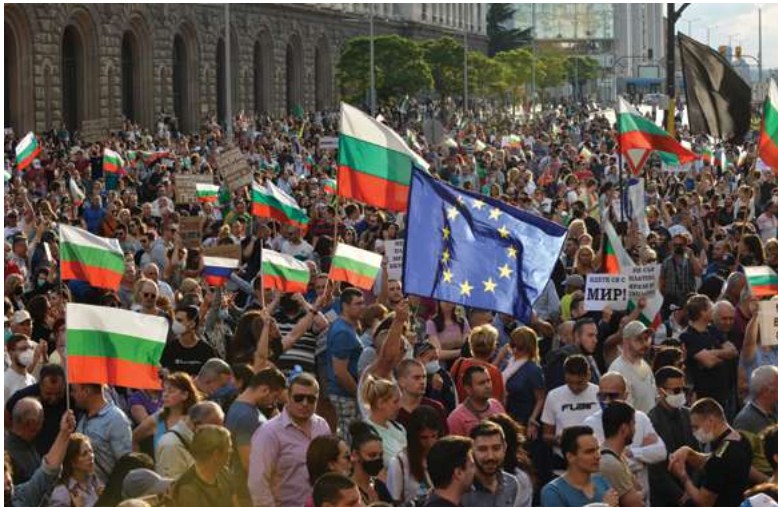
Sofia, Bulgaria—Jul 14 2020, People protesting on the main streets in the capital and demanding PM's resignation.

This misconception was reinforced by Justice Commissioner Reynders during the debates held at the European Parliament on 5 October 2020 , when he stated: “The necessary structures are essentially in place, but Bulgaria has to make them deliver results more efficiently” (EP 2020b). This is a dangerously wrong diagnosis: as stakeholders and scholars have persistently explained, including in direct communication to Commissioner Reynders, the structures themselves are part of the problem. 51 These specialised bodies stand outside the ordinary legal framework, circumventing due process, and are being deployed by the powerful of the day to consolidate their power and deepen the symbiosis between mafia and state. This enables the arbitrary use of power and is hence a direct assault on the rule of law, whose raison d’être is the prevention of tyranny.