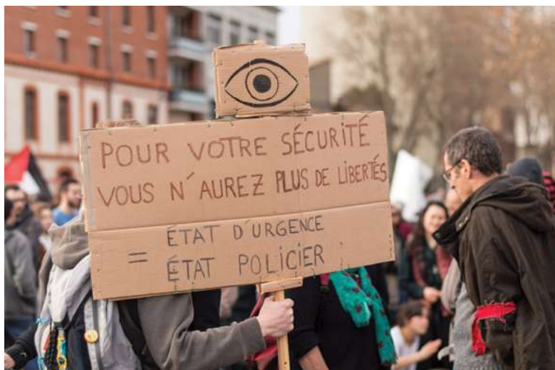
Etat d'urgence. Gyrostat (Wikimedia, CC-BY-SA 4.0)